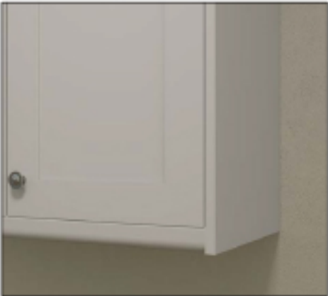
Bullnose Pelmet with Butt Joint