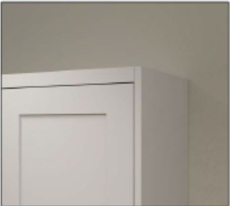
Multi-Purpose Cornice with Butt Joint