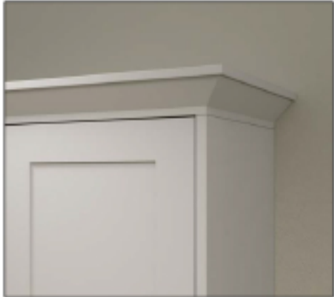
Classic Cornice with Mitre Joint