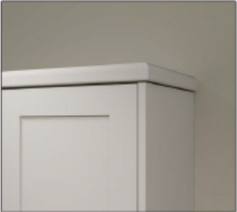
Bullnose Cornice with Mitre Joint